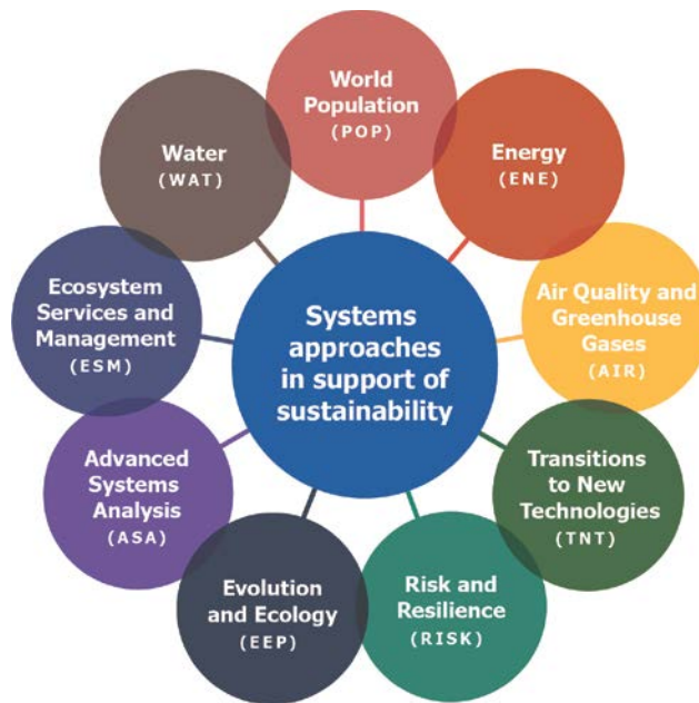
Figure 2: The IIASA research themes.

This framework provides both the foundation for the institute’s research direction over the next five years and the necessary flexibility to modify IIASA activities to accommodate changing scientific or policy priorities.